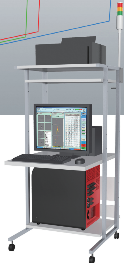
Example of the combination of the Mujiken+ LT and a PC stand

The LT takes the essential concept of the Mujiken series and delivers an easy-to-operate unit with simplified functions. The compact-bodied LT is an inspection system at an affordable price. It can also be used for the inspection of sheets in stages, etc.